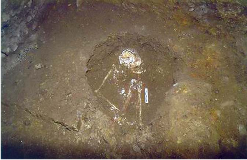
Figure 6. Hoabinhian burials are very rare. This flexed skeleton of an old man from the Ban Rai rock shelter dates to about 10 kya.

date back to 10 kya and includes a number of hearths and the stone tools used to process game and to fashion wooden implements. The animals hunted from this base include gibbons, squirrels, macaques, and civets, denizens of the canopied rainforest. Freshwater shellfish and some marine shellfish were collected, the latter having to come from a 30-km distance. At Moh Khiew, Pookajorn has recovered evidence for Hoabinhian stone tools associated with four inhumation burials, one of which may have been interred in a seated, crouched position. A radiocarbon date suggests that one of the burials is about 25,000 years old (Pookajorn 1994). Unfortunately, only part of the upper body has survived. The other three were all extended inhumations on a north-to-south orientation. Grave goods consisted of flaked stone tools and quartz pebbles. Upper cultural contexts at the vital site of Lang Rongrien contain stone tools that fall within the range for the Hoabinhian hunter-gatherer culture dated between 10 and 6 kya, with flaked core tools such as choppers and axes present.