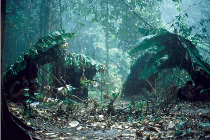
Figure 2. A Mani camp in Southern Thailand.