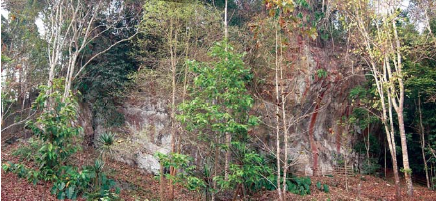
Figure 5. The rock shelter of Tham Lod (image courtesy of Dr. R. Shoocondej).

Thailand, Shoocondej (2006) has excavated the cavern of Tham Lod, where deep deposits of cultural remains were revealed, the oldest stretching back to at least 35 kya (Figure 5; Shoocondej 2004, 2008), when the climate was cooler than today. As at Spirit and Banyan Valley caves, the hunter-gatherers lived near a stream from which the inhabitants hunted the local wild cattle, pig, and deer. They also fished and collected large quantities of shellfish. Several different environmental zones were exploited, including the canopied evergreen forest and the river margins.