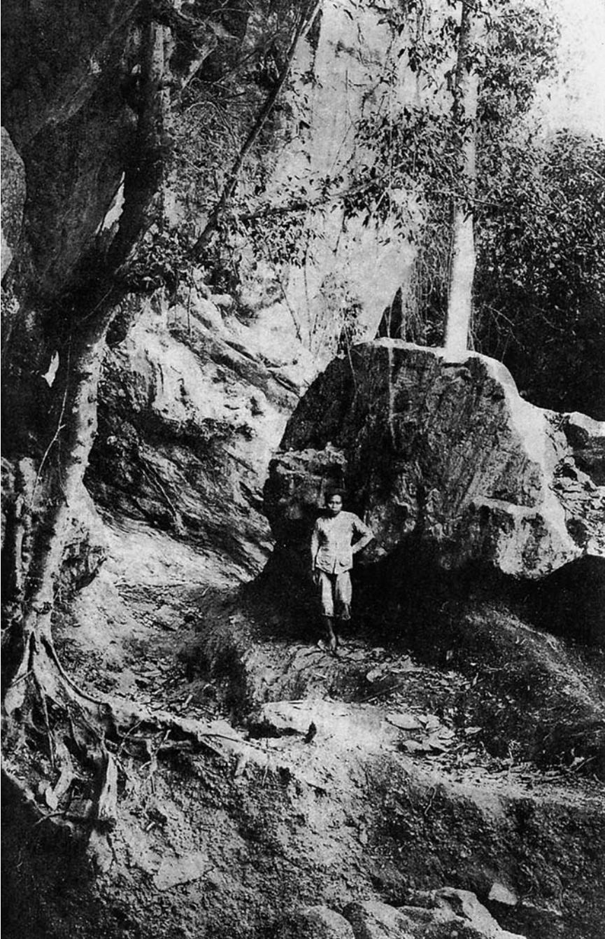
Figure 3. Early excavations by Colani at a Hoabinhian rock shelter (image courtesy of The École française d'Extrême-Orient).