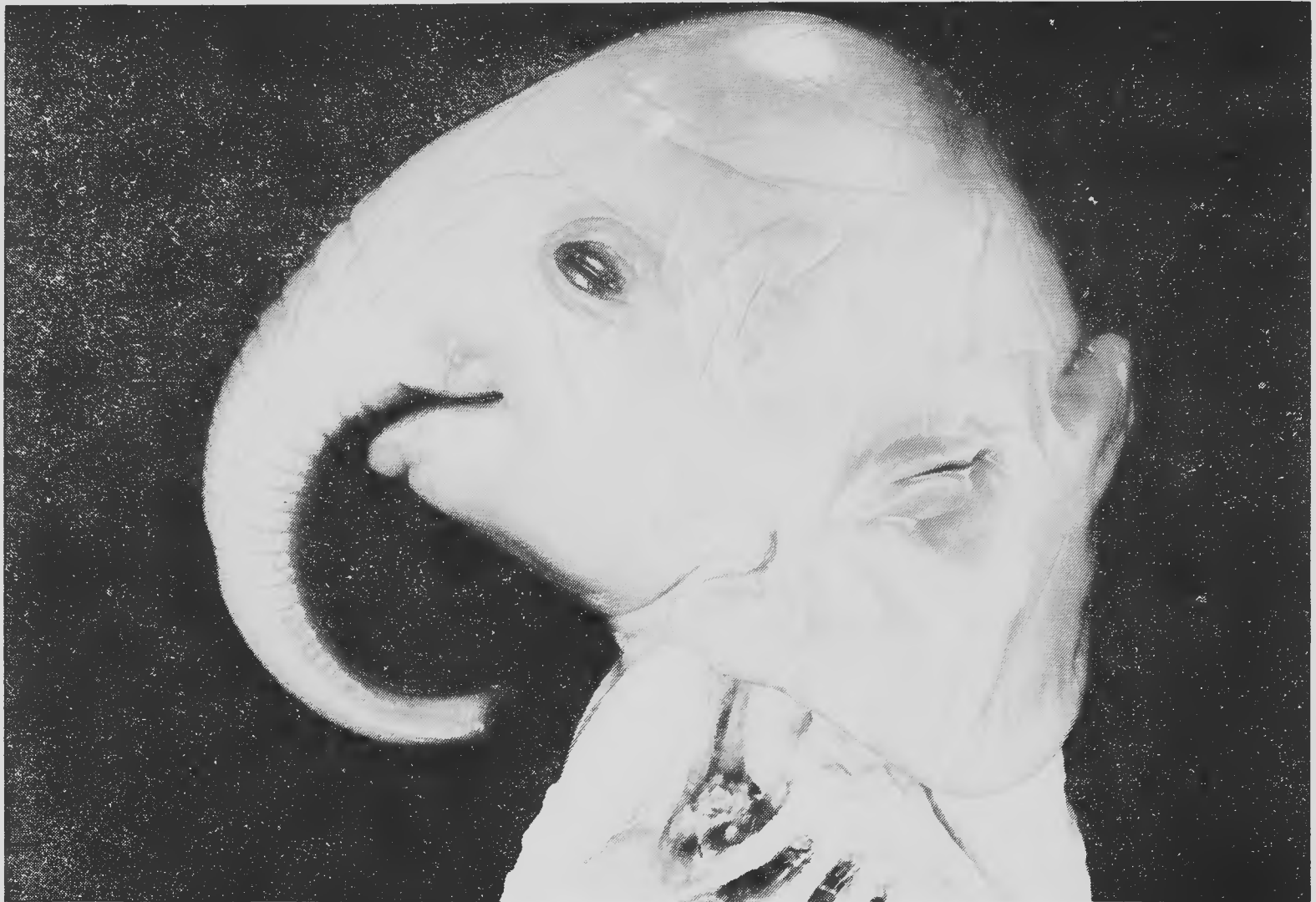
Figure 5. Specimen No. 4 measures: TTL = 440 mm, CRL = 220 mm, HL = 79 mm, TL = 77 mm. This specimen is approximately the size of the fetus of which the external morphology has been extensively described by Bolk (1917).

We realize that the typical shape of an elephant's head with a high forehead and skull roof is seen in all four fetuses and obviously is achieved very early in ontogeny. The age of this fetus has been estimated by the rangers of the Kruger National Park (Republic of South Africa) to be around eight months. This estimate seems to be reasonable, because Toldt's (1913) 565 mm fetus has been given an age of 11 months according to the known date of conception of the dam. A description of the digestive tract of this fetus has been published by Langer (1982, 1984). Much more embryological work remains to be conducted, especially when working with a mammal whose gestation period can be about 22 months long.