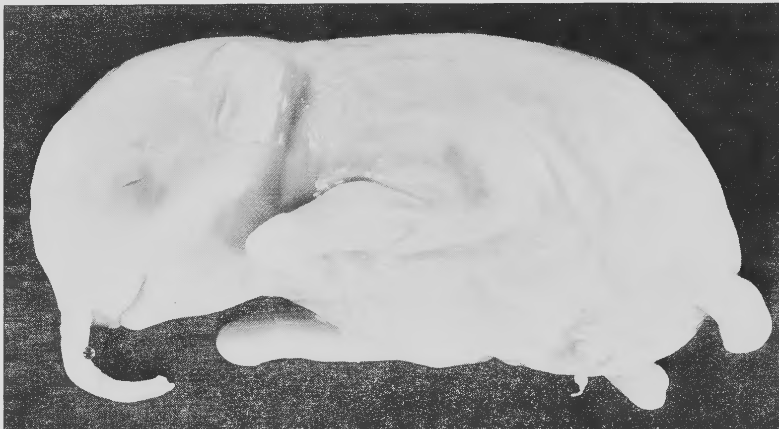
Figure 2. This fetus already displays most elephantine features. Its measurements are: TTL = 310 mm, CRL = 60 mm, Hl = 33 mm, and length of trunk (TL) = 18 mm.

Note that the upper lip is completely distinct from the trunk (Fischer, 1987). This observation contradicts all earlier statements (e.g., Toldt 1913, Bolk 1917, Friant 1933) that the upper lip is always fused to the ventral side of the trunk. The limbs show no sign of digits. In comparison to the other fetuses the tail is unusually short.