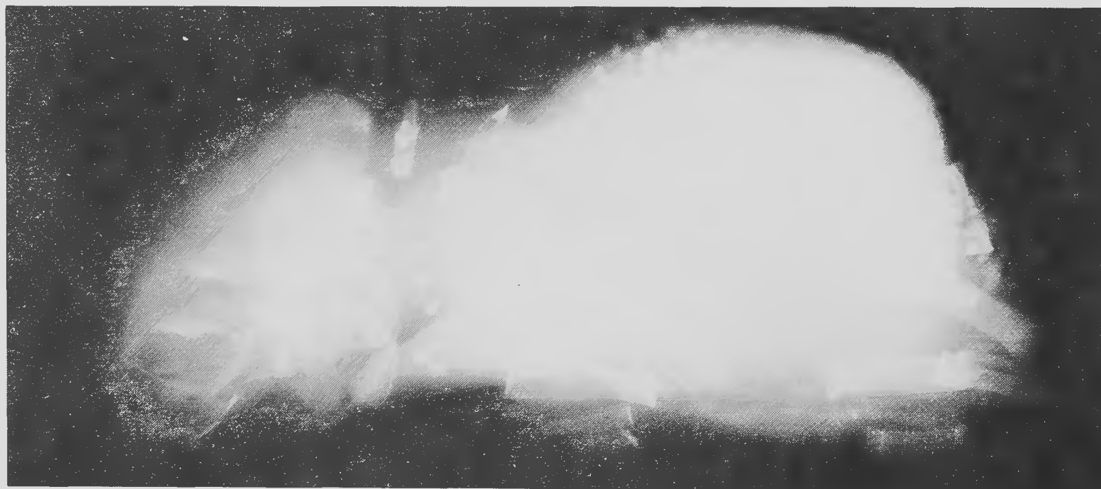
Figure 3. An x-ray photograph of the same fetus shown in Fig. 2. Note that ossification has progressed, especially in the carpus and tarsus.

Note that the upper lip is completely distinct from the trunk (Fischer, 1987). This observation contradicts all earlier statements (e.g., Toldt 1913, Bolk 1917, Friant 1933) that the upper lip is always fused to the ventral side of the trunk. The limbs show no sign of digits. In comparison to the other fetuses the tail is unusually short.