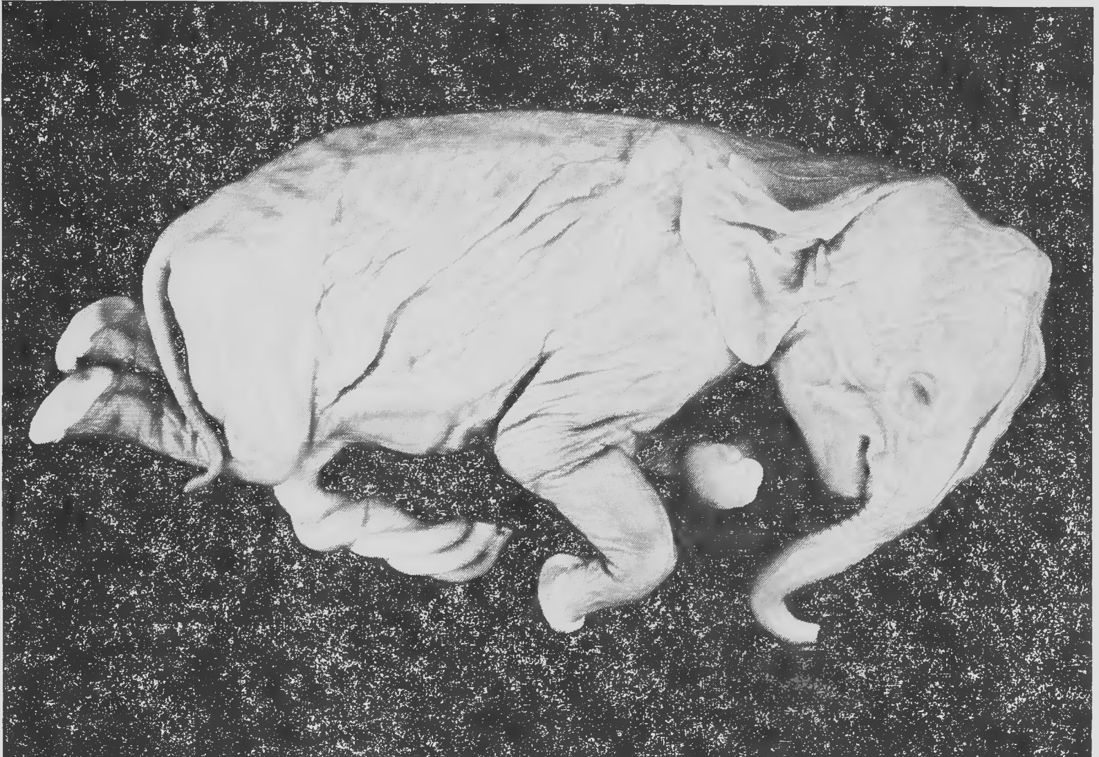
Figure 4. The measurements of specimen No. 3 are: TTL = 310 mm, CRL = 147 mm, HL = 58 mm, and TL = 50 mm.

There is nothing unusual about the external morphology of this elephant, at least nothing which seems to be specific for a fetus, except perhaps the strong umbilical cord. As with the previous specimens, it is difficult even to guess the age. It would be important to get data on the age of these fetuses.