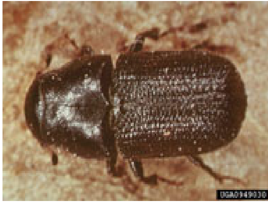
Fig.7 Bark Beetle