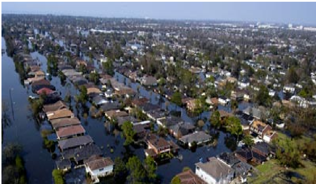
Fig.2 The Flood: Hurricane Katrina's most devastating damage was caused by flooding