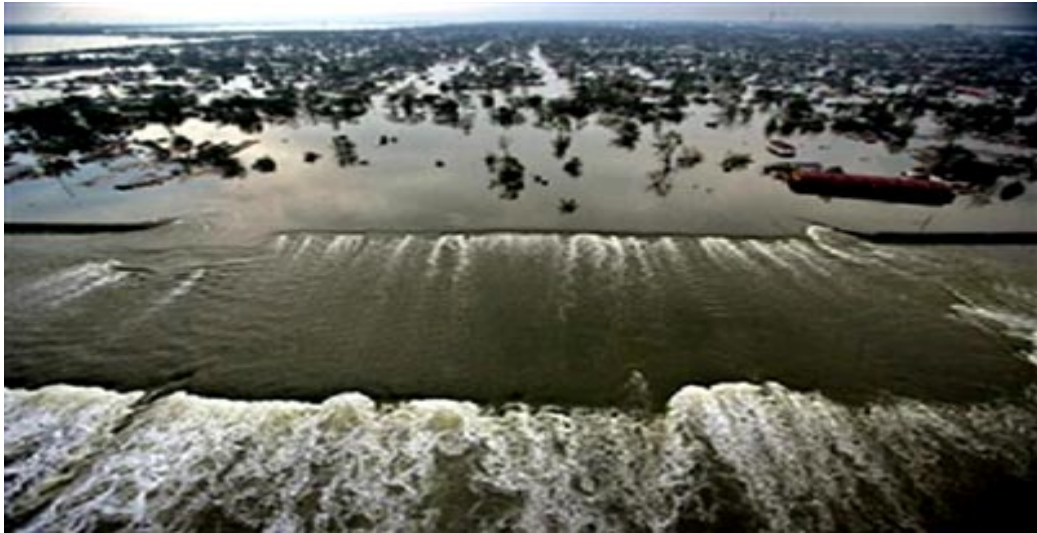
Fig.1 The Levees are Breached: Water pours into New Orleans