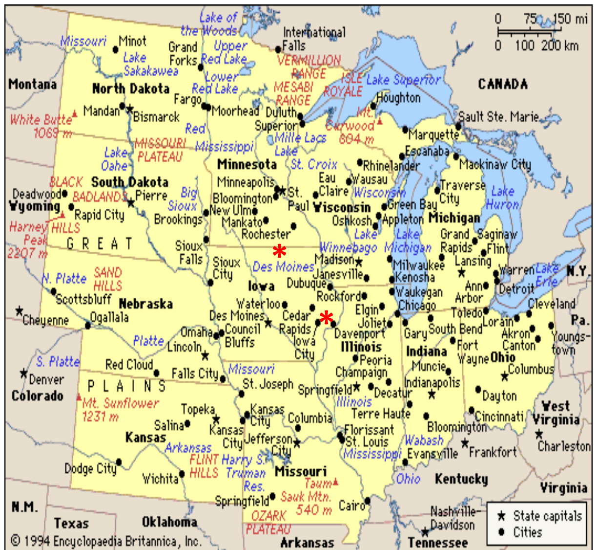
Fig. 10 United States Map

Basins had experienced wet conditions during the 2007-2008 winters and into the spring. Precipitation received across the Upper Mississippi Basin from December