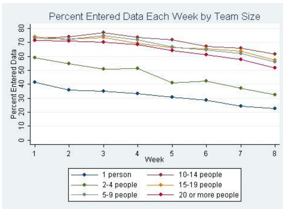
Figure 2 Percentage of participants entering data per week by team size.

in a short period of time using a targeted, large-scale advertising campaign. Because enrollment was limited to a well-defined population, it was possible to calculate the percentage of eligible participants who enrolled and succeeded in the program. Of the 47,074 eligible participants, approximately 16% registered with the site.