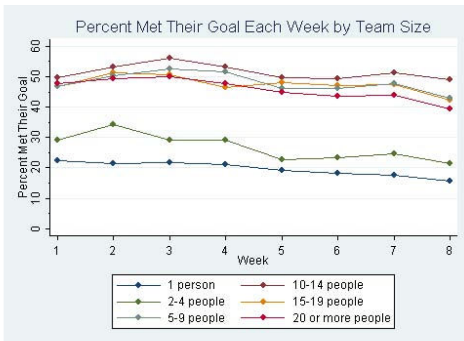
Figure 3 Percentage of participants meeting goals per week by team size.

on individual participants was not shared among team members in Active U, some participants may have been embarrassed, concerned about confidentiality, or they may have been worried that other team members would not want them on the team because of poor performance. Given the finding that competitive team participation is related to better rates of adherence with Active U, it may be important to encourage team participation among those participants in the highest risk groups.