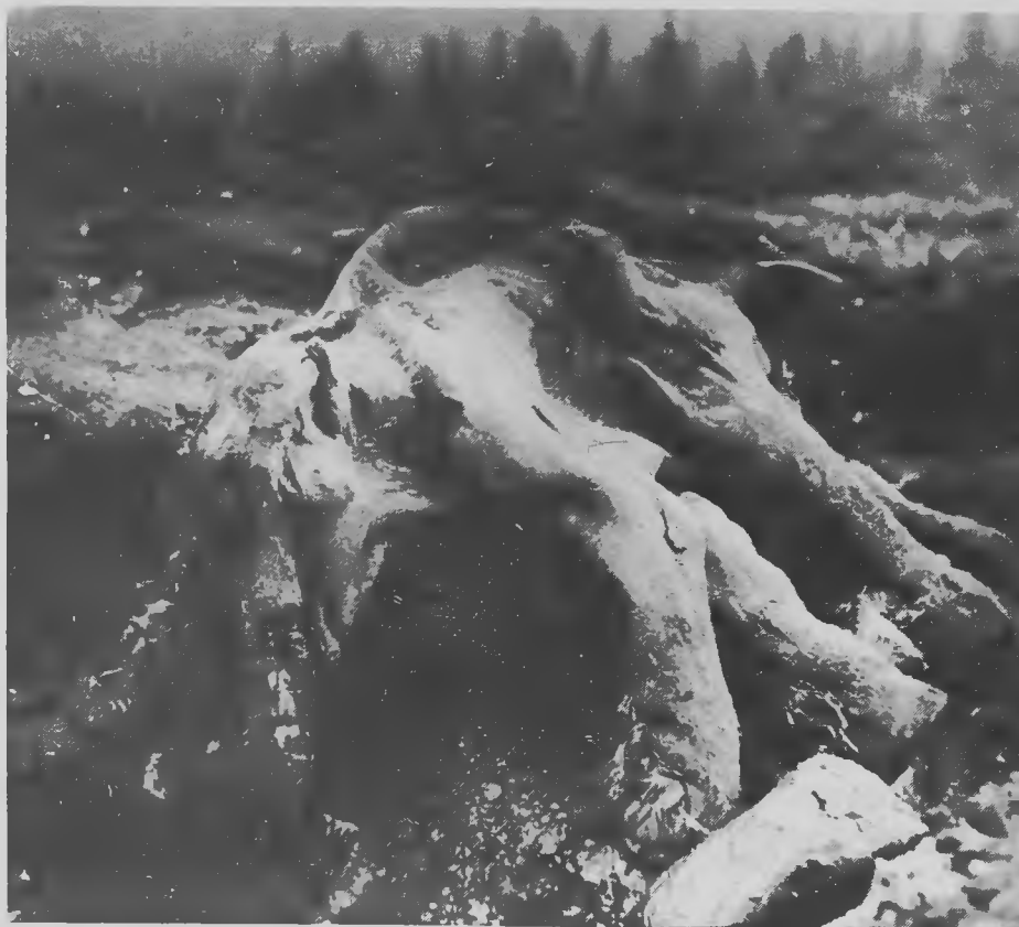
"Dima" at the site of discovery - Magadan.

Research at both universities indicates the mammoth tissues are very well preserved. Perfectly shaped blood cells and protein reactivities have been reported with living elephants and their relatives. Soviet scientists are compiling into book form all data available regarding this mammoth calf and the ecosystem in which it was found. Both groups of researchers were invited to contribute to this proceeding (see references 468 and 474).