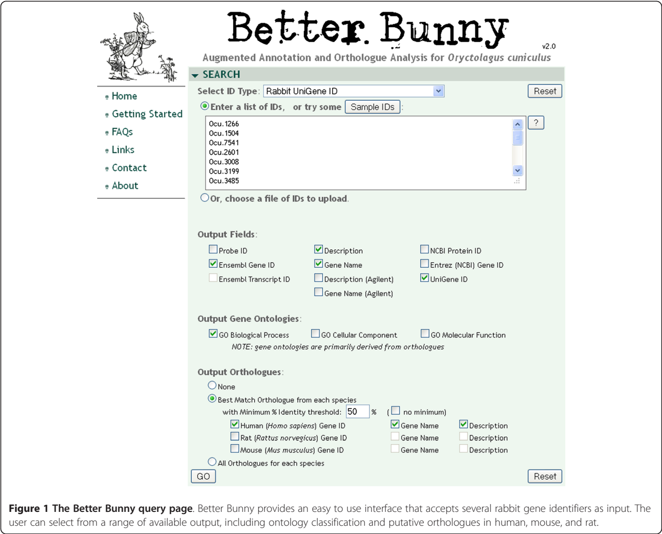
Figure 1 The Better Bunny query page. Better Bunny provides an easy to use interface that accepts several rabbit gene identifiers as input. The user can select from a range of available output, including ontology classification and putative orthologues in human, mouse, and rat.

investigators to perform functional annotation that may otherwise be unavailable. Orthologues can be selected from human, mouse, and rat. The orthologous relationships in Better Bunny are derived from Ensembl and are based on protein sequence similarity. Ensembl employs an automated orthologue identification pipeline that performs pairwise alignments (BLASTP) between all pairs of proteins for all available species [15]. The alignment is performed using the longest protein translation for each gene, and the percent identity displayed in Better Bunny is the value relative to the target (non-rabbit) species. Functional annotation transfer based on sequence similarity is widely used to establish putative function for poorly characterized proteins. While high sequence similarity is not a guarantee of similar function, studies have demonstrated that a threshold of 50-60 % identity ensures a high probability of similar function at the enzyme and gene ontology levels [16]. Better Bunny allows users to specify a minimum required percent identity for the selection of orthologues. An individual rabbit gene