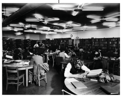
Students and staff at work in room 400 of Old Main at Wayne University, Detroit, Michigan, 1952. The room, originally used as a cafeteria for Central High School, served as the Education Library from July of 1949 to August of 1953

Discussion also included a detailed description of reference service, which provided a bibliographical service to faculty members alerting them to new publications in their areas of research. By providing this research service, as well as hosting a large summer program in Education for graduate students and strong involvement in the university's short-lived Monteith College, the librarians had entrenched themselves far enough into the College of Education that they started to provide bibliographic instruction to courses in the 1960s.